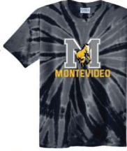
Black Tie Dye