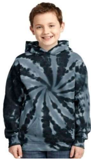
Black Tie Dye Pullover Hoodie