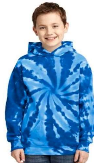
Royal (Blue) Tie Dye Pullover Hoodie