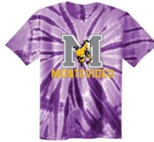
Purple Tie Dye