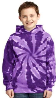
Purple Tie Dye Pullover Hoodie