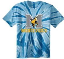
Royal (Blue) Tie Dye